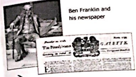
Ben Franklin and his newspaper

The English Bill of Rights As Englishmen, we demand: • Free elections to Parliament • The rights to bear arms, to petition the government, and to a fair trial • No excessive bail or fines or cruel and unusual punishment